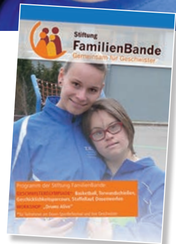
The FamilyTies Foundation is running a programme of events of its own at the Sports Festival.

Zest for life – that is what is awaiting the sportsmen and women taking part in the 12th German Down's Festival in Frankfurt-Kalbach, Germany on 17 May 2014. The festival is being held as part of the HEXAL initiative, "for a better future". Children and adolescents with Down's syndrome can compete against one another, revel in their success, and – even more importantly – have fun with their siblings and parents. The FamilyTies Foundation is also playing its part and inviting everyone to a Siblings Olympics. For the first time, there will be a drum workshop, Drums Alive, which siblings can attend together with their siblings with Down's syndrome. Participation in the festival is free. For news about the event, travel directions, accommodation and the impressions of participants in past years, go to www.down-sportlerfestival.de .