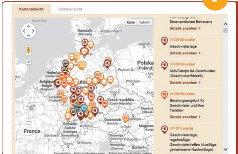
New search options and displays make the support database even more user-friendly.

In designing the new FamilyTies website, our underlying concept was to make it easy for users to find support and information on what is on offer as well as making the search a fun and informative activity. The website is the outcome of experience gained through four years of collaboration with sibling support professionals and organisations. The database, which now contains more than 200 possibilities of support and activities, is therefore the central feature of the new website. Organisations wishing to put the support they provide online can also upload photographs and easily update their entry at any time. The extensive service section for the individuals concerned and interested parties contains a lot of helpful advice for siblings and their parents – e.g. dates, pointers to books and films – and an area with links