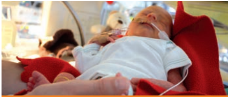
Tiny premature babies need a lot of particularly close contact and affection – from their siblings too.

At the prematurity and neonatal intensive care unit of the DRK Children's Hospital in Siegen, it is not only the tiny patients who are the centre of attention but also, very recently, their siblings.