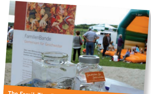
The FamilyTies Foundation was there with a stand