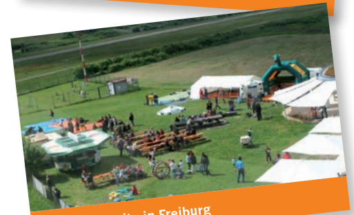
On the BVF site in Freiburg